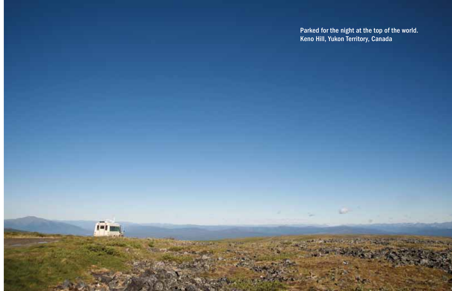
Parked for the night at the top of the world. Keno Hill, Yukon Territory, Canada