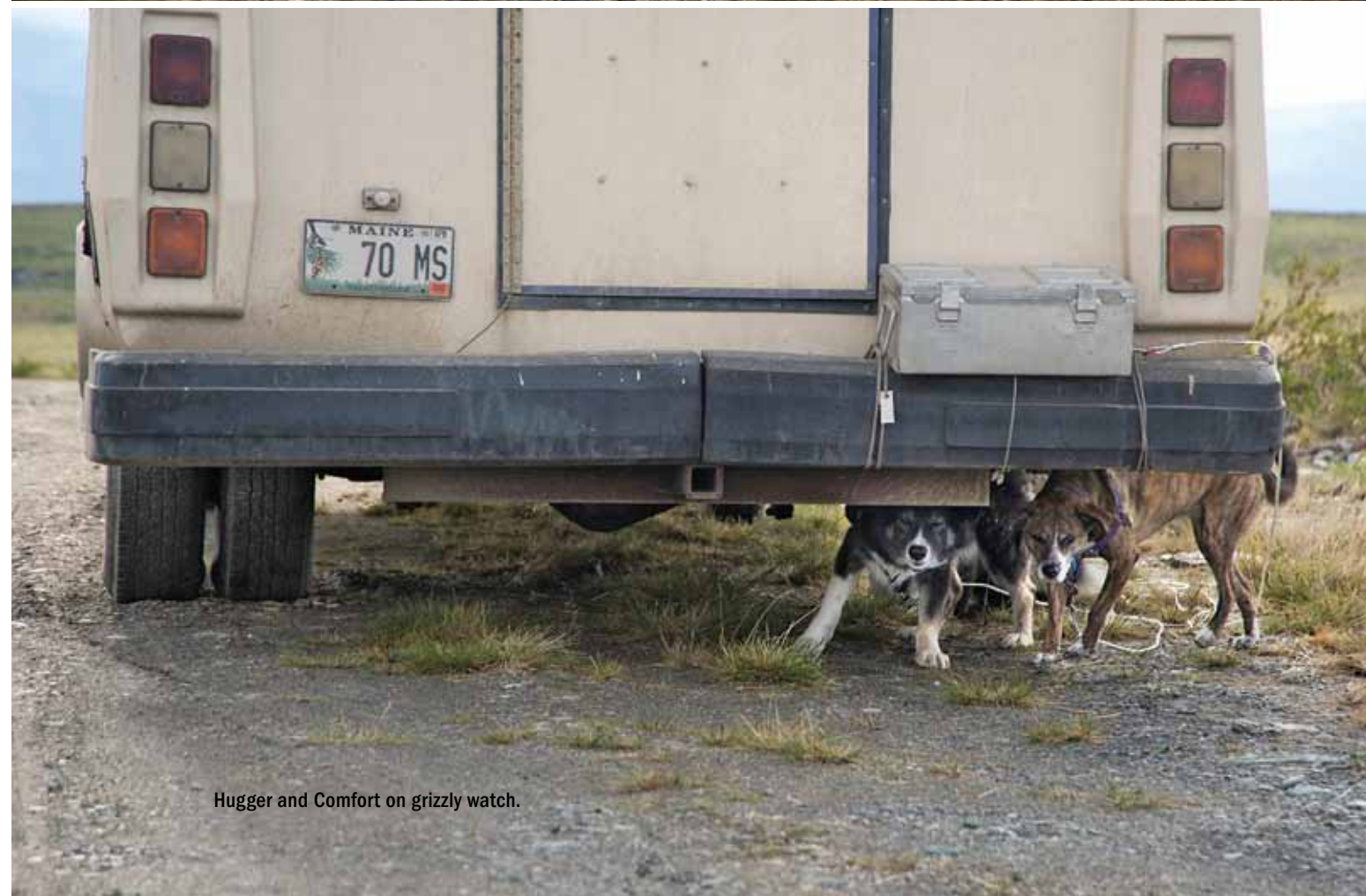
Hugger and Comfort on grizzly watch.