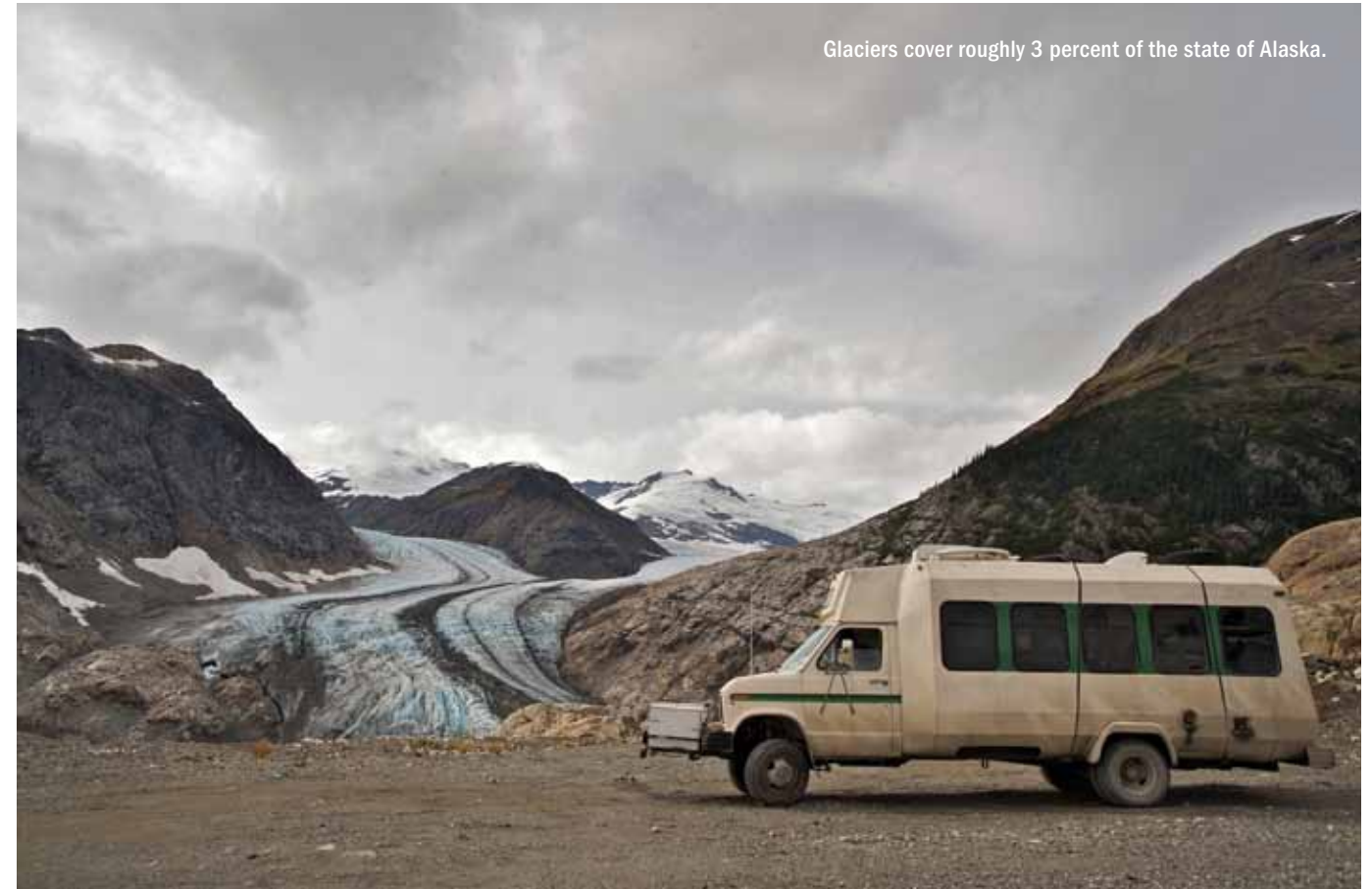
Glaciers cover roughly 3 percent of the state of Alaska.

however, the software had failed again, requiring a 200-mile detour to the last place that could repair it before she headed into the wilderness. The dish was plagued with technical difficulties for the rest of the trip, and whenever it was cloudy—which most days are in Alaska—it wouldn't pick up the satellite at all.