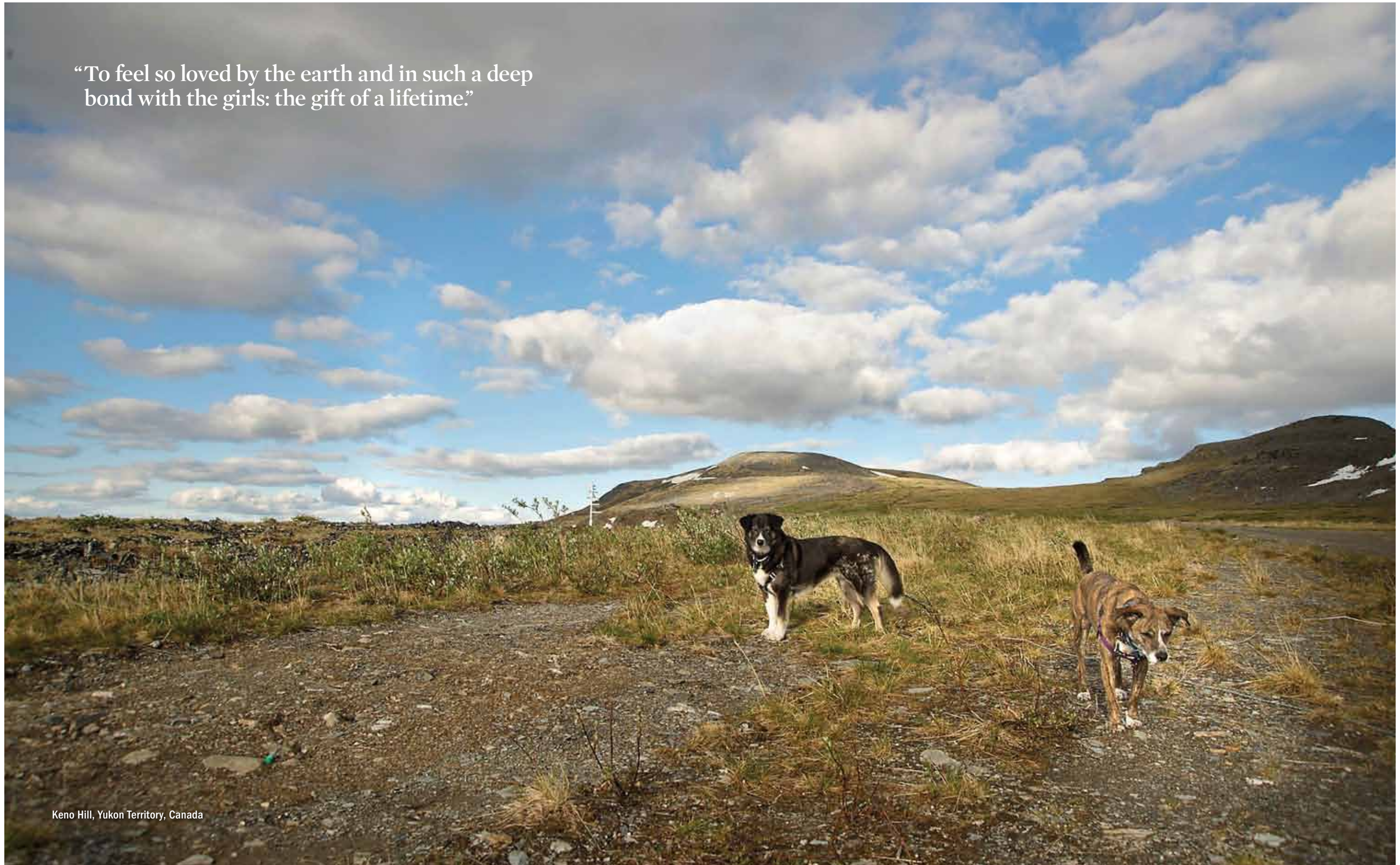
Keno Hill, Yukon Territory, Canada

“To feel so loved by the earth and in such a deep bond with the girls: the gift of a lifetime.”